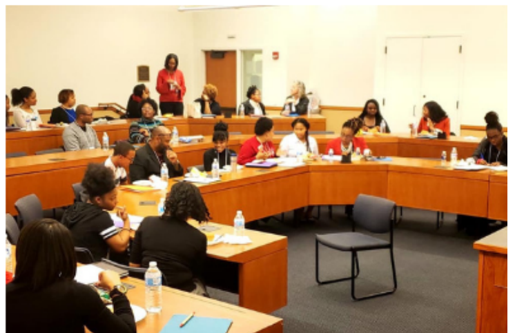
SLMAC events pictured: Karamu, Educational Development Committee | Soweto Gospel Choir Concert, Arts & Letters Committee | Toy Drive, St. Louis NPHC | Fall into Books with Delta, Membership Services | Professional Development Day, Educational Development Committee